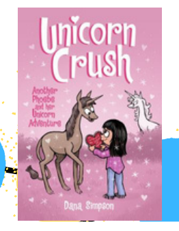
Unicorn Crush by Dana Simpson