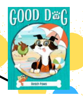
Beach Paws by Cam Higgins