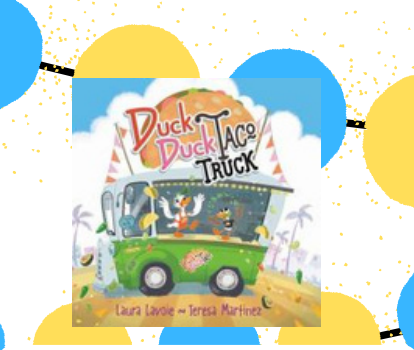
Duck Duck Taco Truck by Laura Lavole